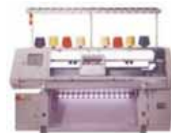
Flat Knitting Machine