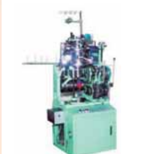
Socks Knitting Machine