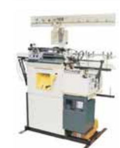
Gloves Knitting Machine