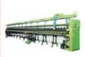
Cone Winding Machine